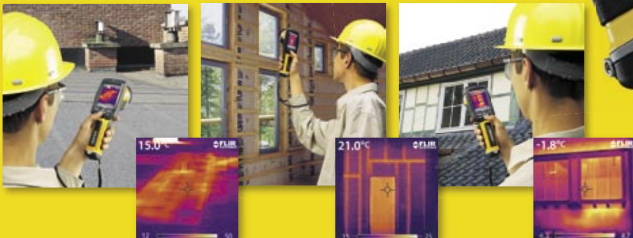
Find water damage

* Now new powerful "QuickReport" software included!